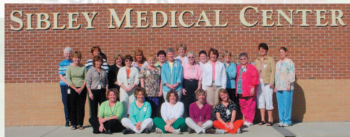
Just a few of the SMC&C employees participating in the Shape-Up Challenge!

The staff was randomly selected into teams which not only compete against one another, but with other organizations as well. Participants earn points for choosing healthy lifestyle choices such as eating 5 servings of fruits/vegetables, 30 minutes of exercise, or making time for themselves each day. The intention of the program is to help create awareness and healthy habits that will continue long after the six week program is completed. Watch for the staff around the facility at noon or break time taking in their exercise walk munching on an apple or carrot stick. Very likely they are competing in the SMC&C Shape-Up Challenge.